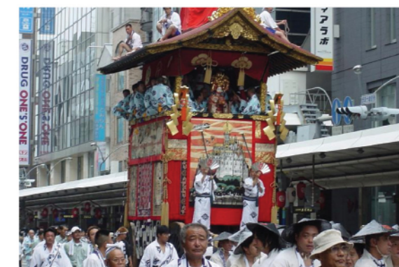
The next day was Gion Festival One of the oldest festival in Japan since 9 th century