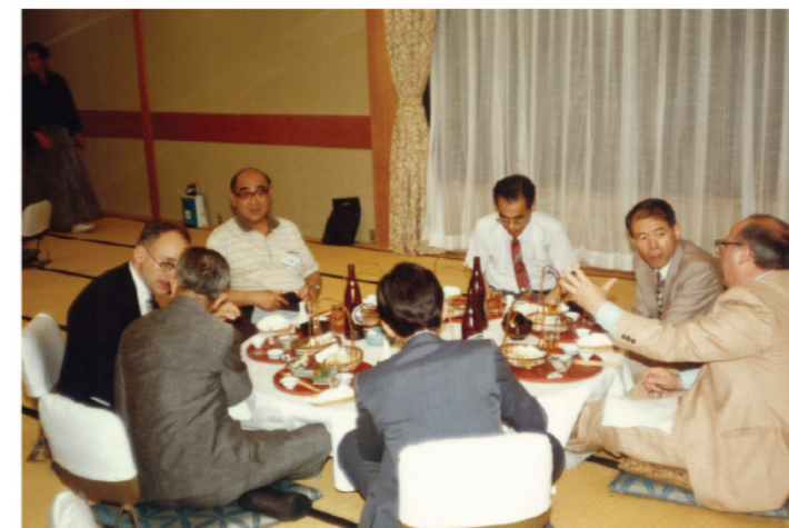
Speakers dinner on Tatami