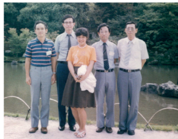
Tenryu-ji, Sagano, Kyoto