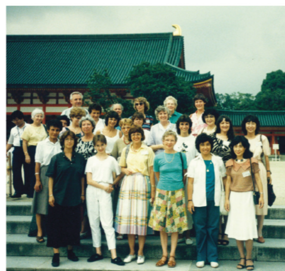
Family program at Heian Shrine