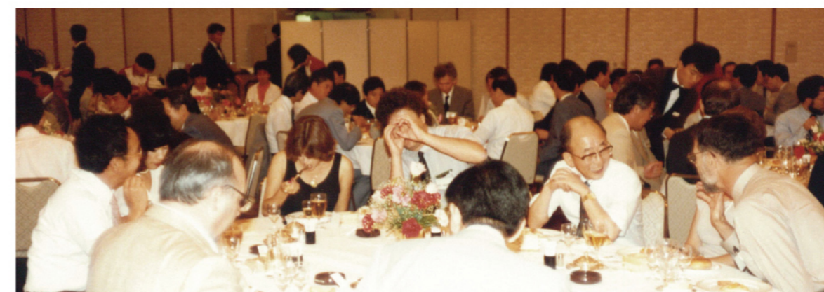
Barrel opening one, two, and three!